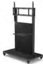
ST23C Mechanical Mobile Stand