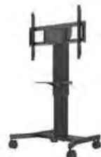
EST05 Electrical Mobile Stand